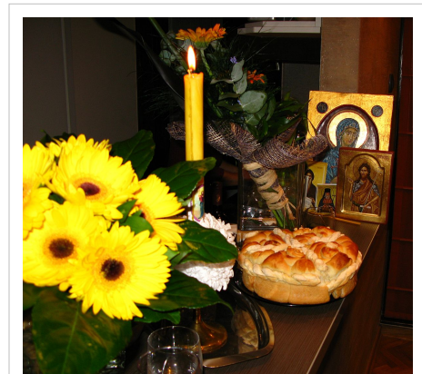
Ikonen mit dem Slavski kolač, der Slava-Kerze und Blumen