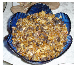
Das Koljivo aus Weizen