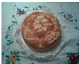
Der Slavski kolač