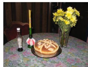
Slavski kolač mit Slava-Kerze und dem Slava-Wein