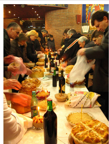
Am Vortag der Slava werden die Speisen in der Kirche gesegnet.

Jedoch unterscheiden sich solche Bräuche von Region zu Region und oft auch von Dorf zu Dorf. Daher besteht keine genaue Beschreibung einer Zeremonie oder genau übermittelten Tradition.